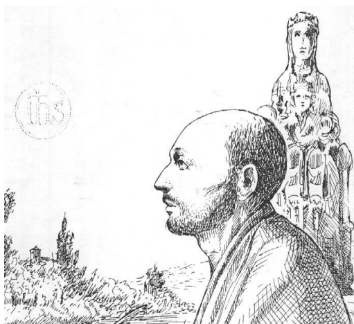
St Ignatius of Loyola

Begin by spending some moments composing yourself . First, sit up straight in a quiet sacred space of your home and then close your eyes . . . focus on your nostrils and be conscious of the precious air that you are breathing in . . . relish God's gift of life to you in each of your breath . . . Sense the presence of the Holy Spirit within you . . . loving and caring for you.