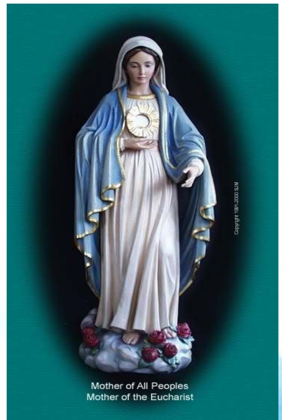
Mother of All Peoples Mother of the Eucharist

(References: Archbishop Burke's Introduction to Ecclesia de Eucharistia & Apostolic Letter Rosarium Virginis Mariae, Pope John Paul II)